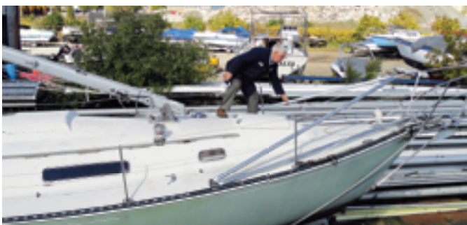
After the mast has been lowered and the after A-frame disconnected from the mast, both frames can be rotated forward so they can be stowed on deck or removed. Once disconnected from the deck, the A-frames "scissor" together for ease of storage.