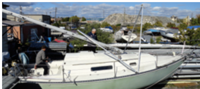
Two A-frames share common pivot points at the deck and are connected by a wire between their apexes. The forward one provides the raising lever and the after one lateral support for the mast.