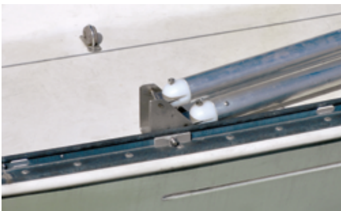
The deck pivot is designed to allow the A-frames to stow one on top of the other when folded down. The toggle connections allow freedom of movement. The bracket is bolted to the toerail so it can be easily removed when not needed.