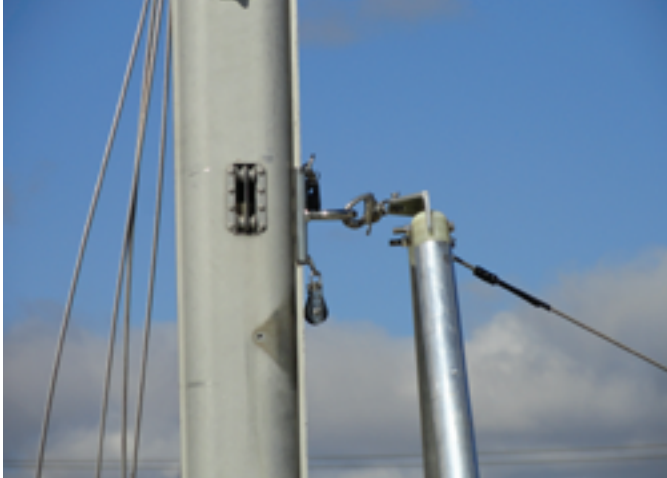
The apex of the after A-frame attaches to the ring on the spinnaker-pole car with a snapshackle. The stainless-steel wire leading forward connects it to the forward A-frame.