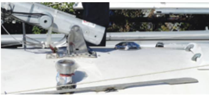
A custom-made stainless-steel tabernacle allows the mast to pivot and also serves as the mast step.