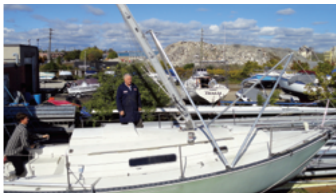
The pivot point of the A-frames is not level with that of the mast, but the apex of the after A-frame, attached to the spinnaker-pole car, accommodates the offset by rising up the mast as the mast is being raised.