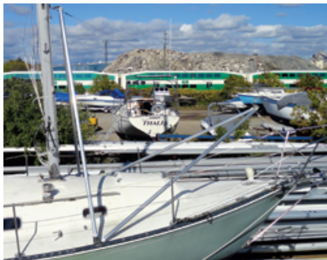
When the mast reaches its fully vertical position, it remains supported by the A-frame while the shrouds are connected to the chainplates.